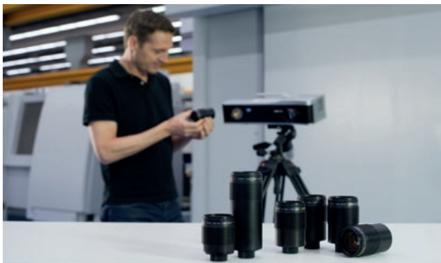
The right sensor for every application:

The high-performance software platform colin3D ensures a consistently efficient and project-oriented procedure during the entire measuring process.